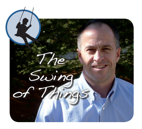
A Letter From Our General Manager

A s General Recreation, Inc., is always looking for better ways to serve our partners, friends, and clients, we thought that a quarterly newsletter would be a great way to keep you informed about industry trends and updates, product innovations, safety standards, and project highlights.